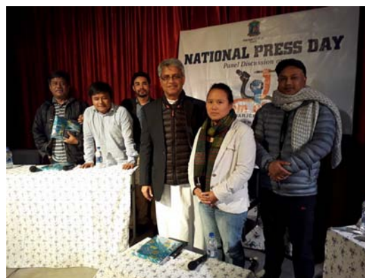
Photo: Principal poses with the panellists and moderator.